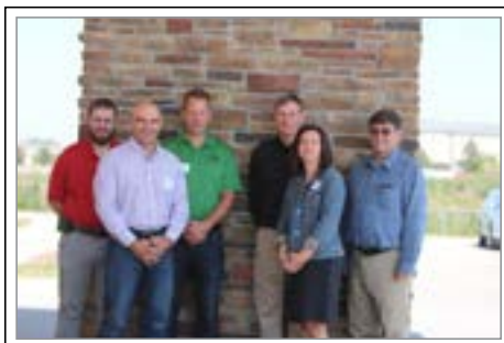
TSPN Board Members