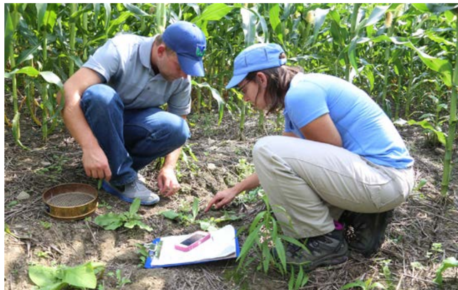
(Evaluating aerial cover crop seeding results)

For more information about the Technical Service Provider program, including certification, please visit the NRCS website .